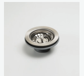
AC14 Basket Waste