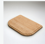
AC15 Bamboo Board