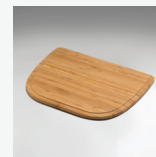
AC74 Bamboo Board