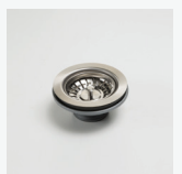
AC14 Basket Waste