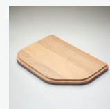
AC65 Bamboo Board