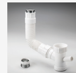
AC12 Rinse Bypass Kit