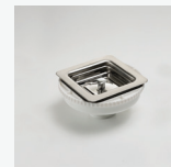
AC175Q Basket Waste