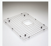
ACPSQ8 Bowl Protector