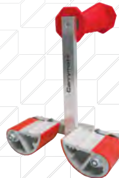
CARRYMATE Senior span width 40-120mm