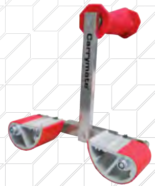
CARRYMATE XL span width 80-160mm