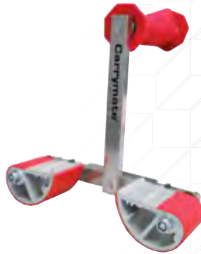
CARRYMATE XL span width 80-160 mm