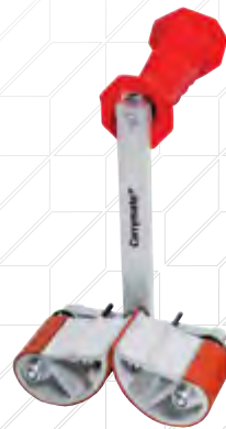
CARRYMATE 5 span width 0-80mm