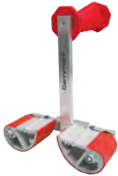
CARRYMATE Senior span width 40-120 mm

The unloading and transportation of sheet materials to their installation sites is not only time-consuming but also very strenuous. Smooth surfaces make it difficult to securely carry the material, especially through narrow passages or across uneven ground. Carrymate ® Transport Grips are used in pairs and each grip is capable of lifting up to 100 kg, which makes them suitable for moving a wide variety of materials.