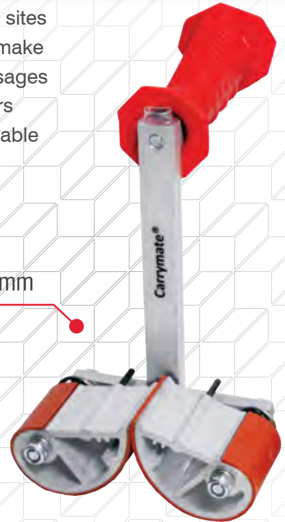
CARRYMATE 5 span width 0-80 mm